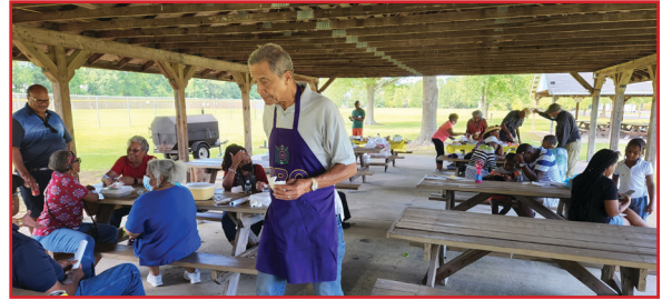
The FCA was gratified to see so many of our neighbors turn out.