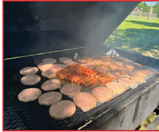
Burger and dogs in the preparation stage.