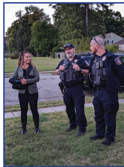
Hampton PD provided toys for neighborhood children. The FCA provided snacks and bottled water.