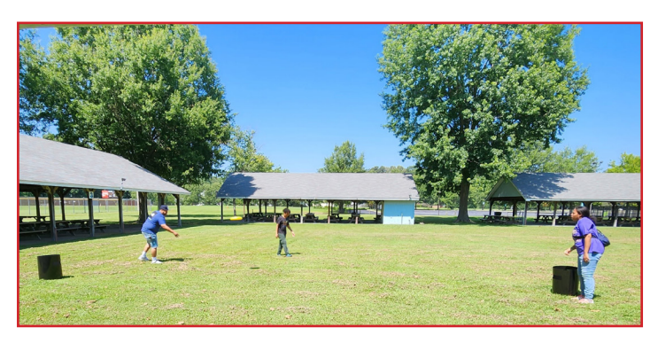
Residents took advantage of the beautiful weather to play games like Kan Jam and croquet

Thanks to all who turned out for the second consecutive year of the recently-resurrected FCA Summer Cookout! Residents gathered on August 19th in the spirit of community, broke bread with their neighbors, and even played a few games in the grass lot adjoining the picnic area of Liberty Baptist Church.