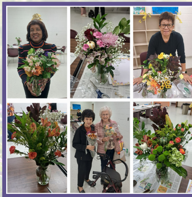
Members create fall floral designs.